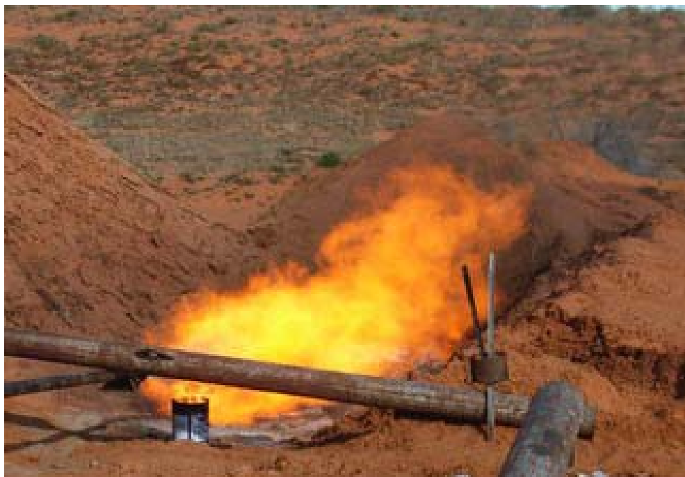
Vanessa-1 Gas Discovery – Flaring at 4.9 MMCFD at 750 PSI on ½” choke

The acquisition of new 3D seismic in the north west of the permit - over currently mapped shallower oil prone targets at Basal Birkhead Level in the Jurassic oil fairway passing across PEL-182, is also proposed.