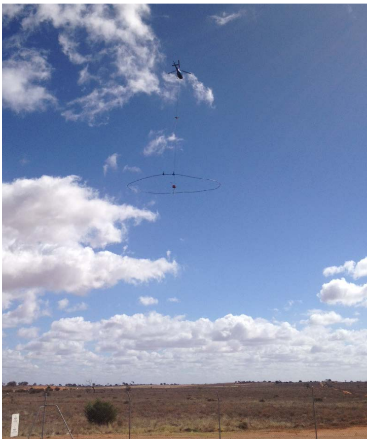
Scout line preparation at Port Augusta airfield - systems check