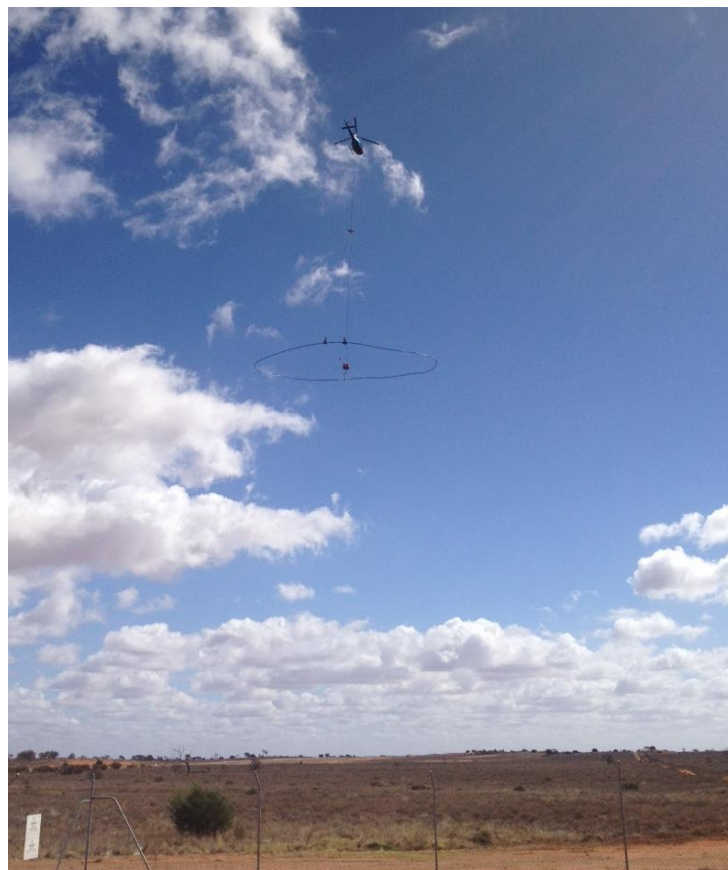
Scout line preparation at Port Augusta airfield - systems check