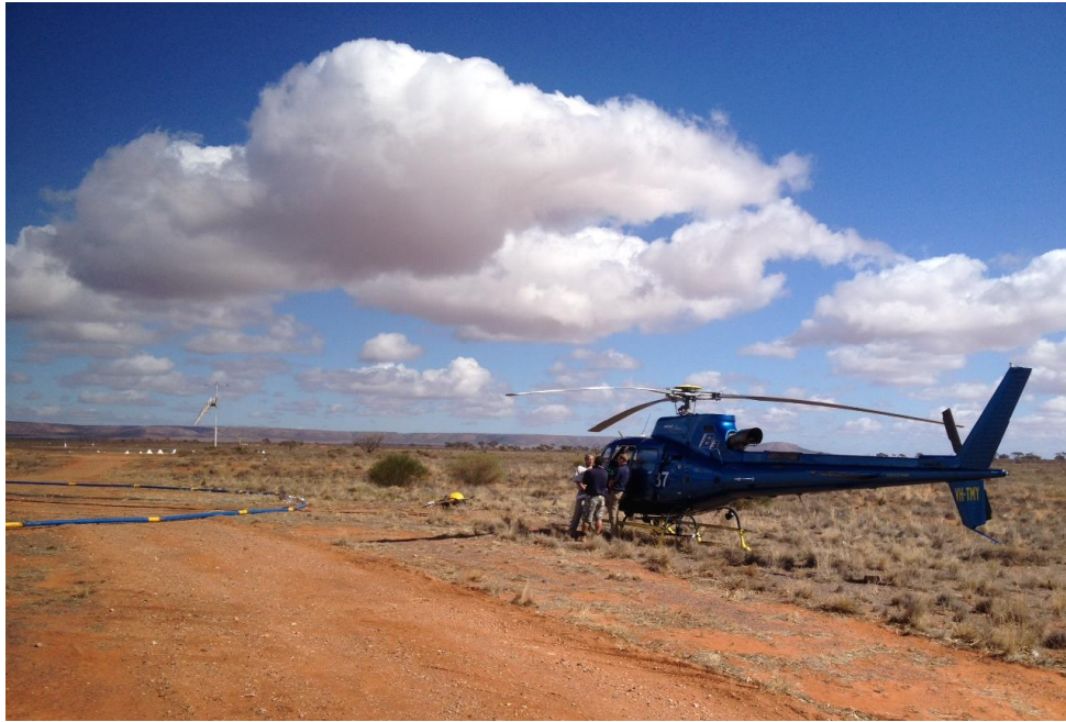
Helicopter at Port Augusta airfield - survey set up