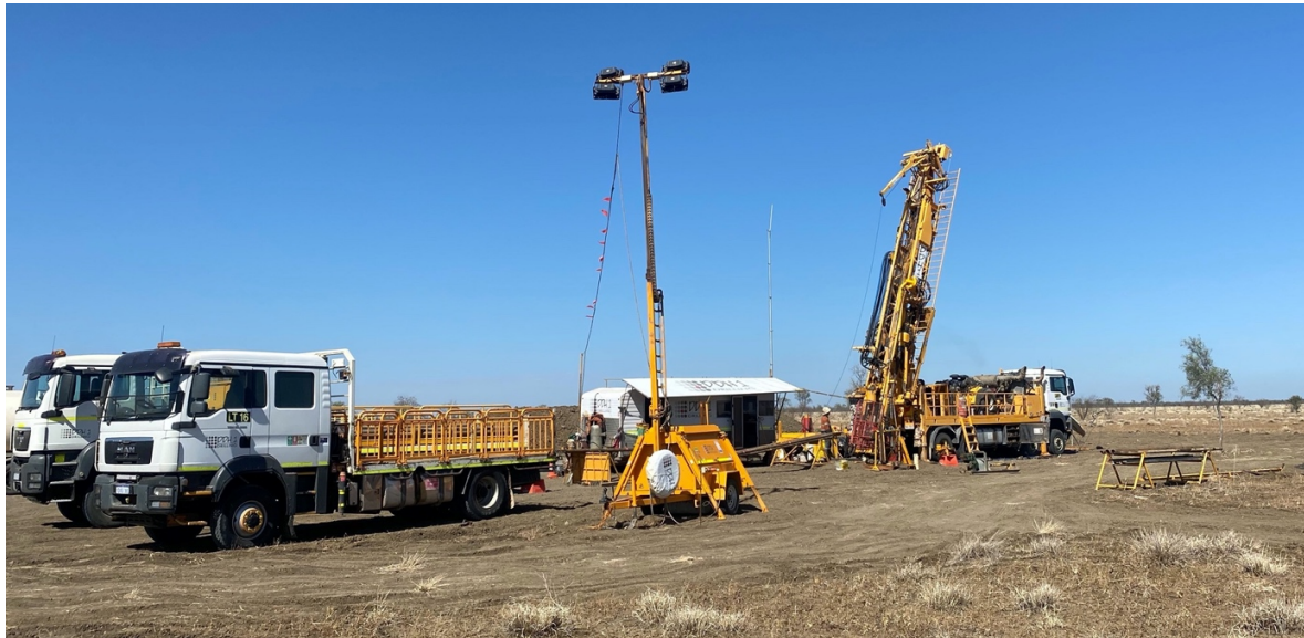
Figure 2: Diamond drill rig on site at Saxby Gold project, NW Queensland

As SER's understanding of the greater Canobie district has evolved, we have become convinced the district represents an extension of the Cloncurry IOCG province. As such, SER has now pegged five additional exploration licence applications surrounding our existing two licences to bring our total land holding to more than 1600km 2 .